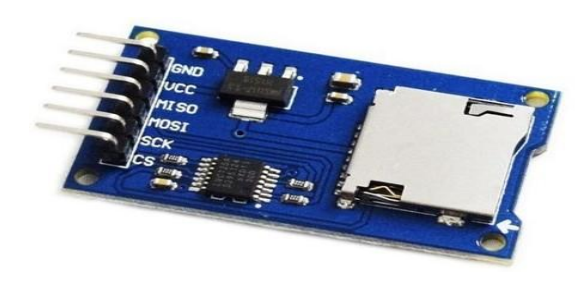
Fig. 2. SD Card Module

3. PIR Sensor - PIR sensors allow you to sense motion, almost always used to detect whether a human has moved in or out of the sensors range. They are small, inexpensive, low-power, easy to use and don't wear out. They are often referred to as PIR, "Passive Infrared", "Pyroelectric", or "IR motion" sensors.