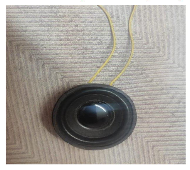
Fig. 8. Speaker