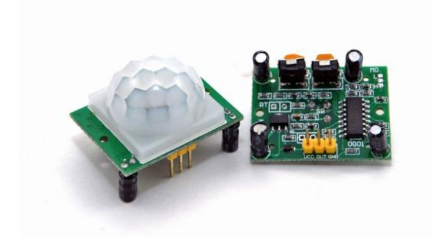
Fig. 3. PIR Sensor

6. Jumper Wire - Jumper Wire is an electrical wire, or group of them in a cable, with a connector or pin at each end, which is normally used to interconnect the components of a breadboard or other prototype or test circuit, internally or with other equipment or components, without soldering.