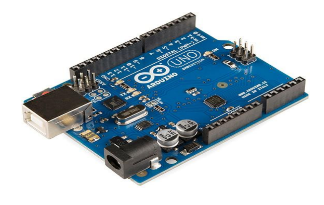
Fig. 1. Arduino Uno

1. Arduino Uno R3 - The Arduino Uno R3 is a microcontroller board based on a removable, dual-inlinepackage (DIP) ATmega328 AVR microcontroller. It has 20 digital input/output pins (of which 6 can be used as PWM outputs and 6 can be used as analog inputs). Programs can be loaded on to it from the easy-to use Arduino computer program.